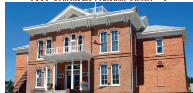
1881 Courthouse Museum, Custer, WY

Sunday morning check out. Optional: Cowboy Church, or farewell brunch at 11am at highly recommended "Donna's Restaurant" downtown Newcastle. (Depending on your travel arrangements and if you are traveling by car or plane.)