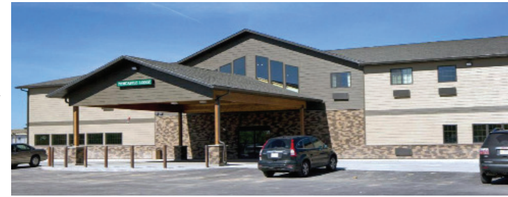
Newcastle Lodge • 307-746-2600 22918 US Highway 85, Newcastle, Wyoming

There are many choices in the town of Newcastle, you will find suggestions and recommendations for steak houses and other eateries in your welcome bag. One steak house that was a highly recommended was "Antlers Restaurant and Lounge". Lots of good reviews and a warm western ambiance.